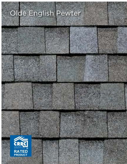
Olde English Pewter